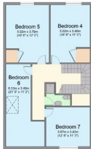
Floor area 90.0 sq. m. (969 sq. ft.) approx