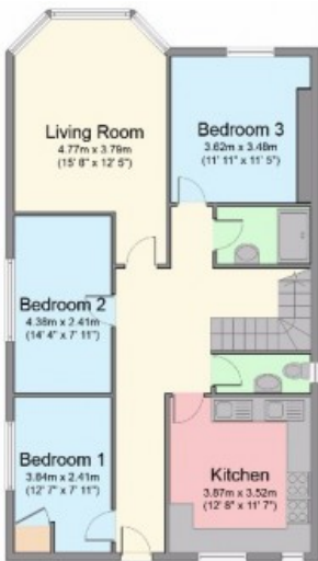
Floor area 93.0 sq. m. (1,001 sq. ft.) approx