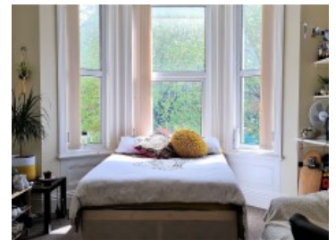
1 Beechwood Avenue Total floor area 248.0 sq. m. (2,669 sq. ft.) approx.