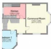
Ground Floor area 72.0 sq. m. (775 sq. ft.) approx