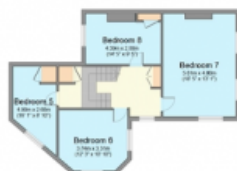
Second Floor Floor area 71.0 sq. m. (764 sq. ft.) approx