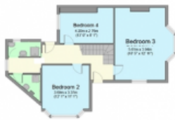
First Floor Floor area 71.0 sq. m. (764 sq. ft.) approx