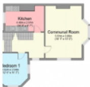
Ground Floor area 72.0 sq. m. (775 sq. ft.) approx