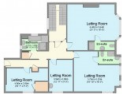
First Floor Floor area 125.0 sq. m. (1,345 sq. ft.) approx