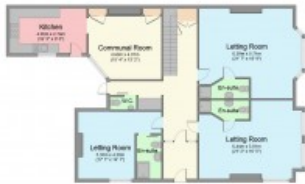
Ground Floor Floor area 158.0 sq. m. (1,701 sq. ft.) approx