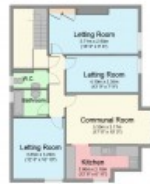
Second Floor Floor area 87.0 sq. m. (928 sq. ft.) approx

Floor plans are for identification purposes only. All measurements are approximate.