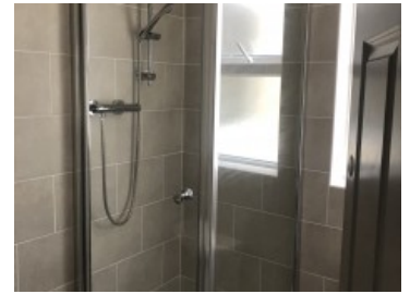
38 Houndiscombe Road Total floor area 160.9 sq. m. (2,048 sq. ft.) approx.