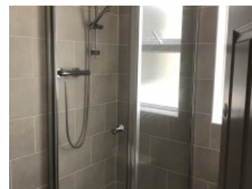
38 Houndiscombe Road Total floor area 186.9 sq. m. (2,048 sq. ft.) approx.