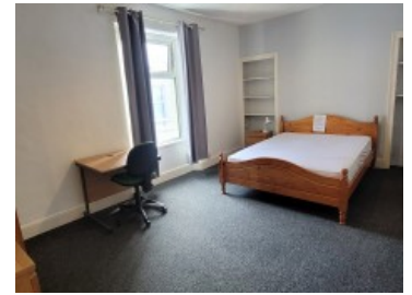
19 Nelson Street

Total floor area 167.9 sq. m. (1,152 sq. ft.) approx