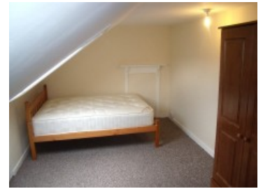
184 North Road West Total floor area 173.0 sq. m. (1,862 sq. ft.) approx.