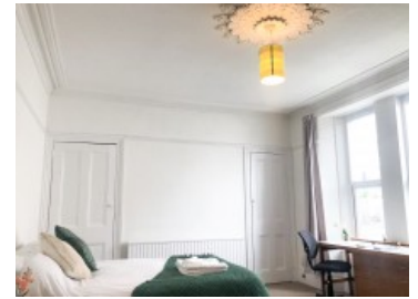
44 Southern Terrace

Total floor area 167.0 sq. m. (1,798 sq. ft.) approx.